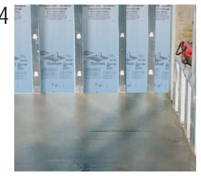
Pour concrete up to the screed board or back into the stud bays at the required finished slab height.

NOTE: See Section R506 of the 2009 International Residential Code for more information about floor slab requirements.