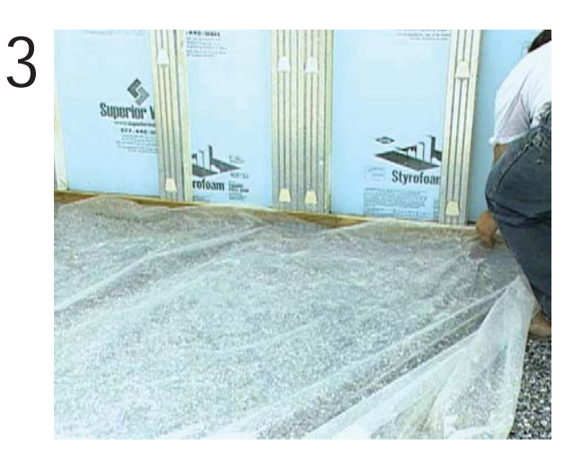
Install a vapor retarder per code.

Fasten a piece of lath at the desired height of the concrete floor to form a screed board, or the screed board may be omitted to allow the concrete floor pour to flow between the stud cavities on top of the Superior Walls footer beam. Typically allow a minimum of 2" direct contact between footer beam and floor slab.