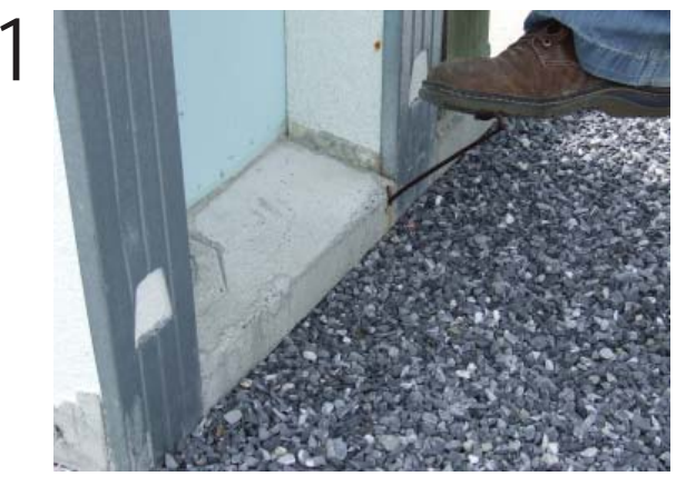
Bend slab connectors into concrete floor pour if provided.

This document is designed to supplement and clarify the typical floor pour procedures listed in the Superior Walls Builder Guideline Booklet (BGB). A current PDF copy of the BGB is available at www. superiorwalls.com.